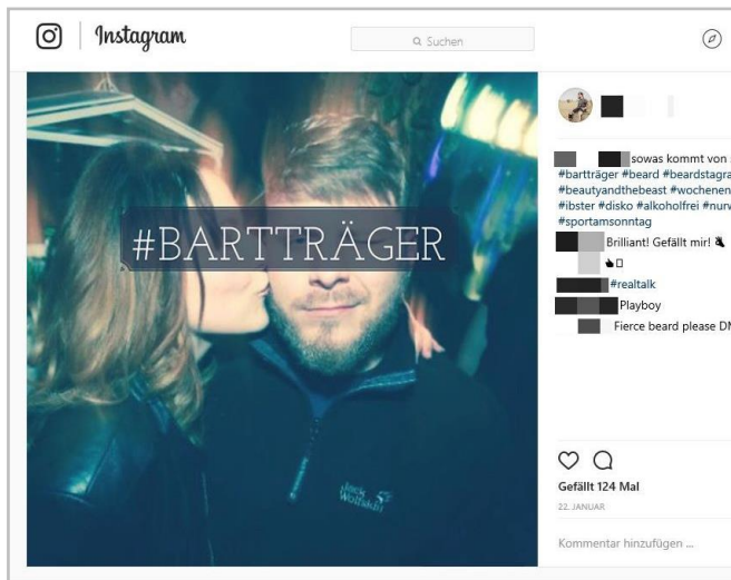
Right-wing extremist posts stylish images under the harmless, widely-used hashtag 'beard wearer'.

has no character limits they often post numerous hashtags in order to spread content in different discourses. When searching for a certain hashtag related to a subject users can quickly come across right-wing extremist content not recognizable as such at first sight. An appealing photo can be enough to win over new followers.