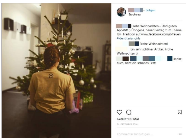
A Christmas photo, only the T-shirt logo reveals: the user is a female right-wing extremist

During the research for this paper, jugendschutz.net recorded 70 cases of illegal content; among these symbols and slogans of unconstitutional institutions, incitement of the people and Holocaust denial, found in images and memes on anonymous profiles and pages. Instagram removed more than 90 percent of all illegal content reported.