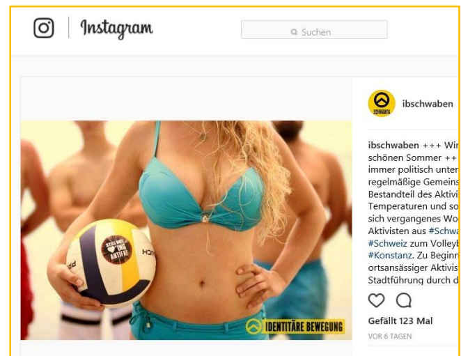
Using a sexist image to arouse interest and lead to right-wing extremist messages.

Whereas the photo seems harmless at first sight, the accompanying text directly invites users to make contact and actively participate. Here, the Identitarian movement presents itself in the style of an innocuous leisure project that is 'not always out and about politics' and also offers young people 'regular joint tours'. The full description of a trip to a regional city ends with the words: "We wish all activists, supporters, sympathizers and followers a beautiful summer! Not active yet? Then quickly drop a mail to [e-mail address of the Identitarian group Swabia]!"